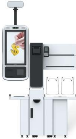
▲ SCO+Cash+Bag Dispenser