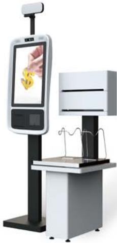
▲ SCO+Bag Dispenser